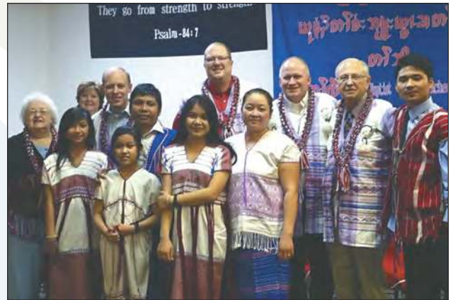
We serve in ... Rockford Karen Baptist celebrated their sixth anniversary with friends from First Baptist, Machesney Park, where the Karen congregation has met since 2008.