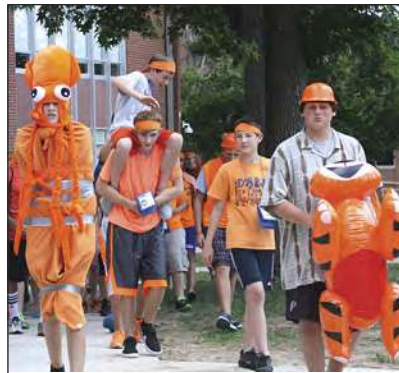
The "orange school" prepares for recreation at IBSA's Super Summer, held every year at Greenville College.

The gray school, for recently graduated seniors, may focus on how to take your faith with you to college. (One fun note: The gray school also has designed their own special entrance onto the rec field. While the other schools run and yell, gray schoolers, as the oldest Super Summer participants, walk as slowly as possible.)