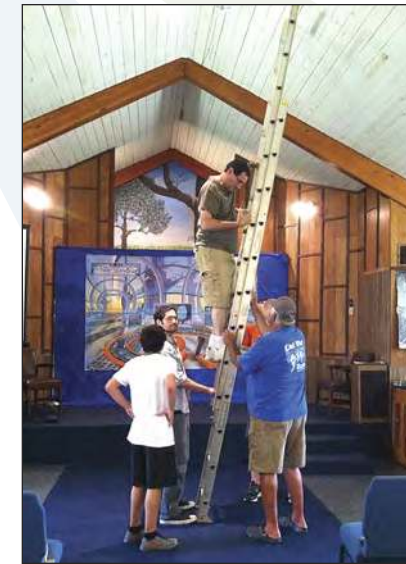
We serve in ... North America Volunteers from an Illinois mission team work on a construction project at a church in Louisiana.