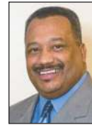
First African American SBC President, Fred Luter 2013

“Sin,” his wife replied. “What did the preacher say?” the man asked. “He was against it.”