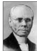
First SBC President, William Bullein Johnson 1845

An old joke goes like this: A woman returned home after Sunday service. From his easy chair her husband asked, “What was the ser- mon about?”